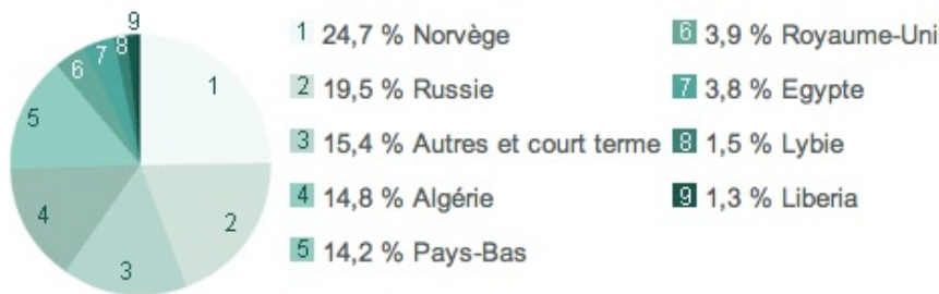
Répartition des approvisionnements par origine géographique

Or maybe they actually understand it, because they've been working on security for the past 40 years? Liberalisation can help those that did not make the effort to set up long term contracts, diversify sources, build storage capacity to freeride on those that did. No wonder the careful planners are a bit wary of seeing their insouciant neighbors, who have spent the past 30 years scoffing at their prudence while sitting on the North Sea treasure, now claiming their "solidarity" now that the treasure (which they did not share for the greater good of European energy security) is gone.